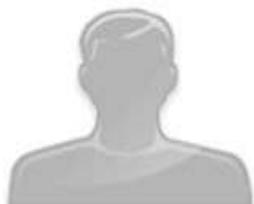
Photo of the author (optional)

First and last name of author Position and workplace (Institution)