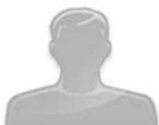
Photo of the author (optional)

Mail Full address of institution Location, country The phone number with the code